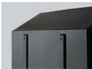
Rails on back allow for air circulation