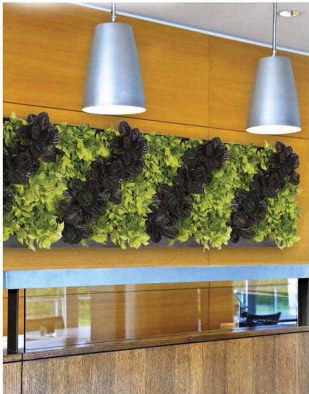
Four PP-3232's arranged horizontally