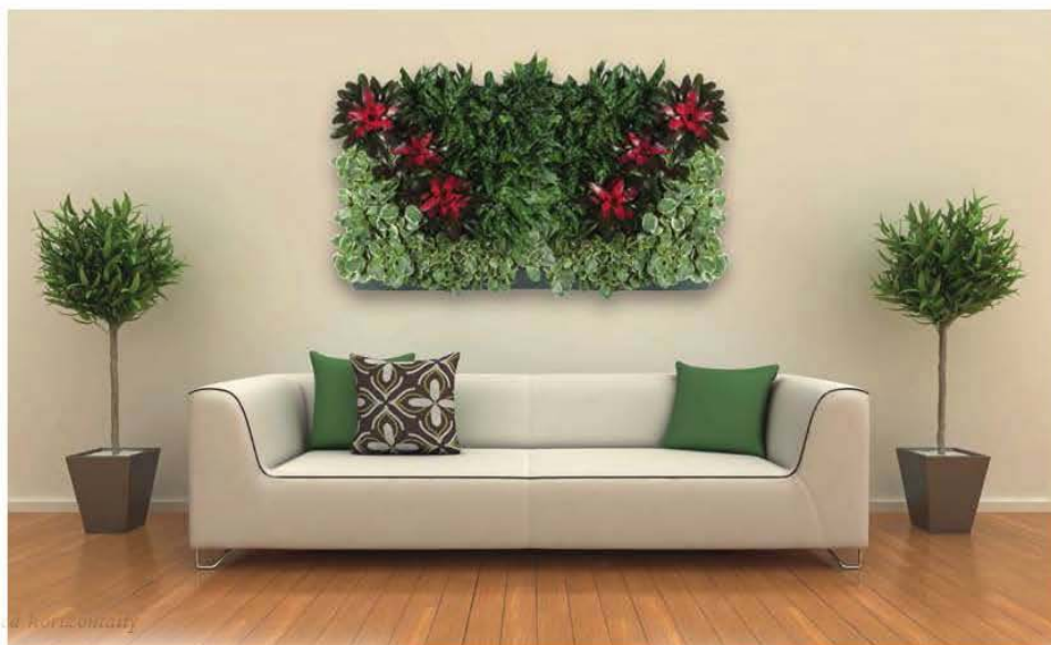
Two PP3232's arranged horizontally